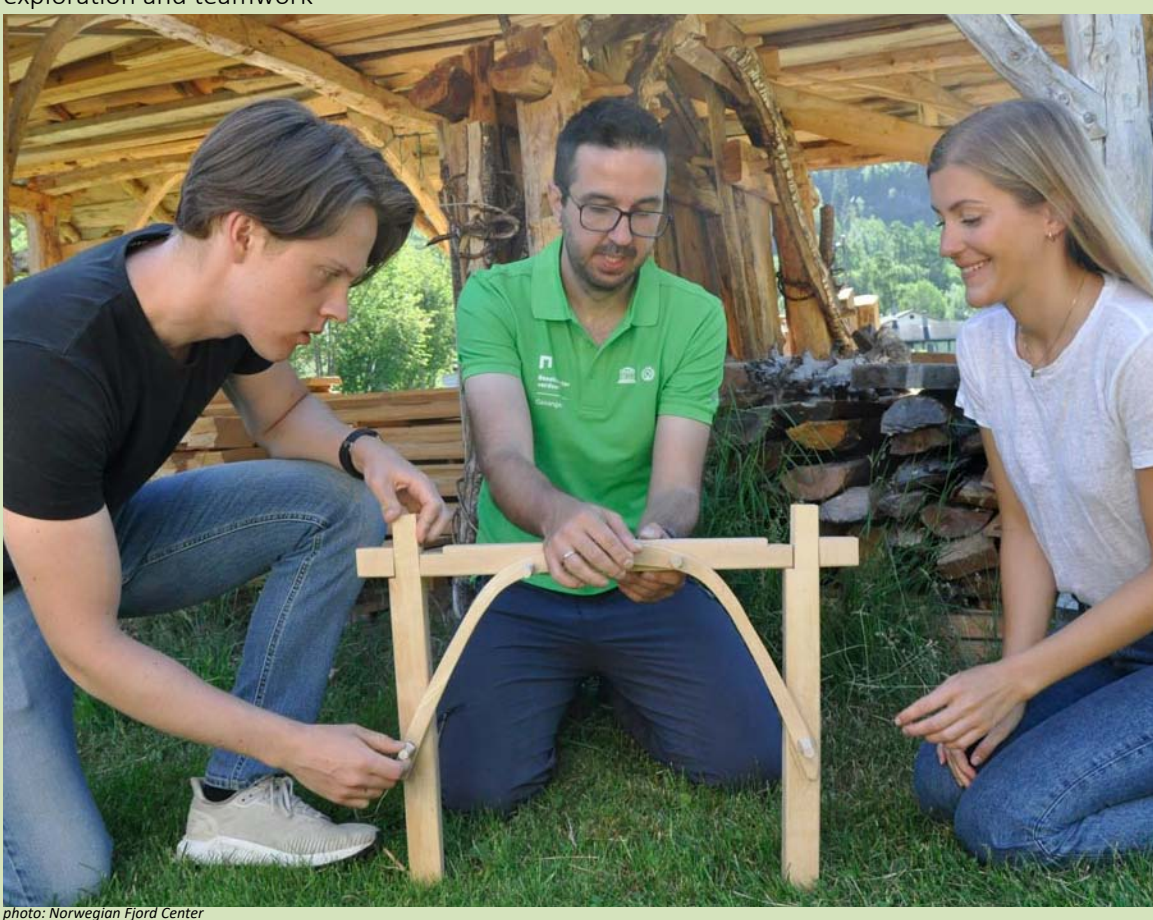
Duration : 1-2 hours by the World Heritage Visitor Centre / Norwegian Fjord Centre Join our Fjord Ranger on a journey through time.

See how the glaciers and rivers have shaped the landscape. Learn more about the diversity of the flora and fauna in the world heritage site, and about the fragile biological interactions.