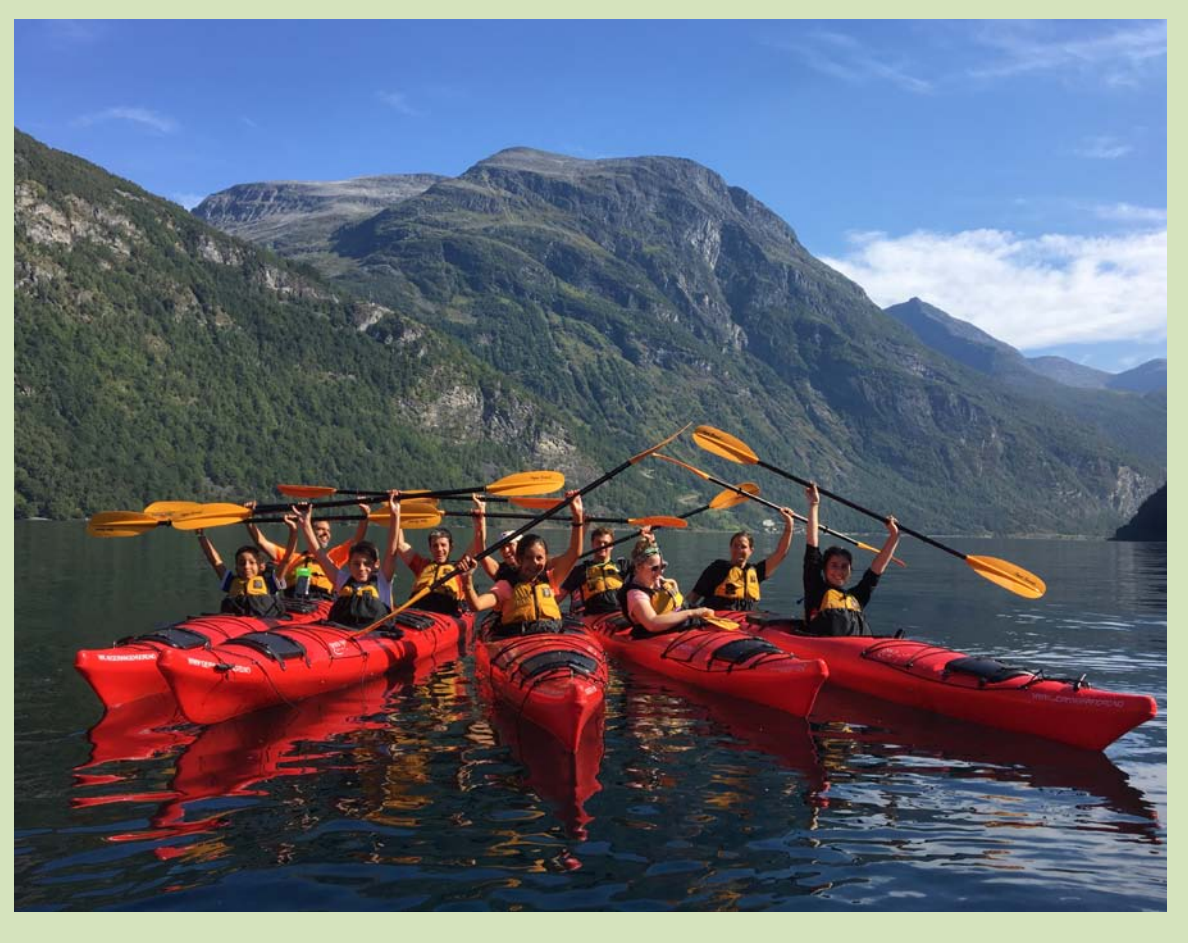
Duration : 2-5 hour tours, and rentals by the hour.

Let our qualified guides lead you for a fun kayak adventure on the Geirangerfjord. Our stable kayaks are easy to paddle and turn so you can relax to enjoy the scenery.